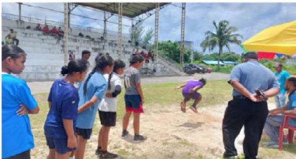
Car Nicobar, Sept. 4

No subsequent claim will be entertained or considered from any candidate, irrespective of his merit, fails to appear in person or does not produce necessary certificates in original at the time of counselling/selection, a press release from Deputy Secretary (Hr Edn) said.